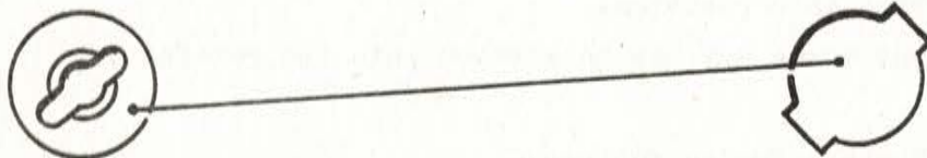
FIG. 1 MODEL F700 MKX HEADLAMP ADJUSTMENT SCREW RETAINER

APERTURE WITHOUT RAISED LIP FOR LATER TYPE RETAINER